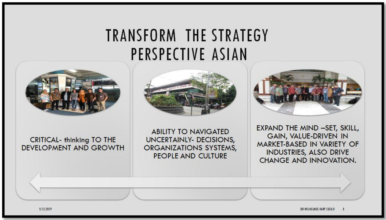
Figure 2. The Transform of the Strategy Perspective Asian