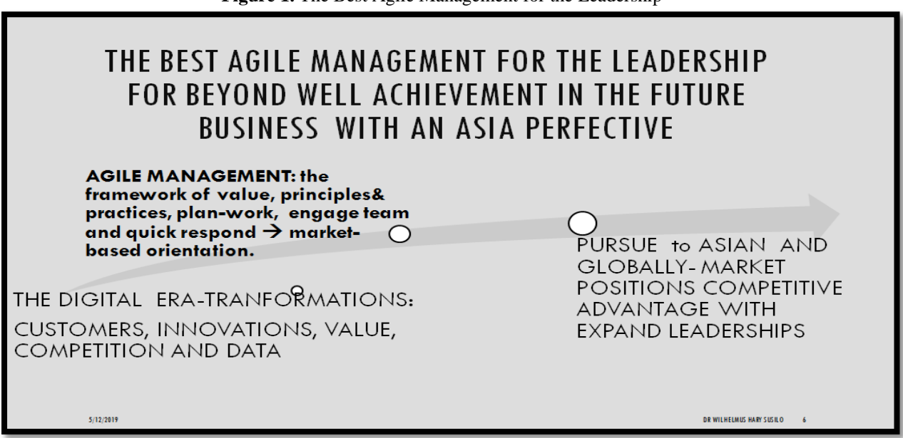
Figure 1. The Best Agile Management for the Leadership

Actually, for anticipated the paradigms in future market, the model that will assist companies to improve plans for the future marketplace. The scholars should be present a new concept, "edited platforms," as a consumer aware, but company driven, and the product development-model, conducted the empirical models for attain the organizations aims with best solutions in market-based management.